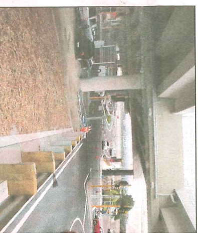
NO TROUBLE: Traffic appeared to be flowing fine Maunganui.

He expected the pressure on the Chapel St off-ramp to ease as commuters worked out different ways to reach their work, such as continuing down the flyover to